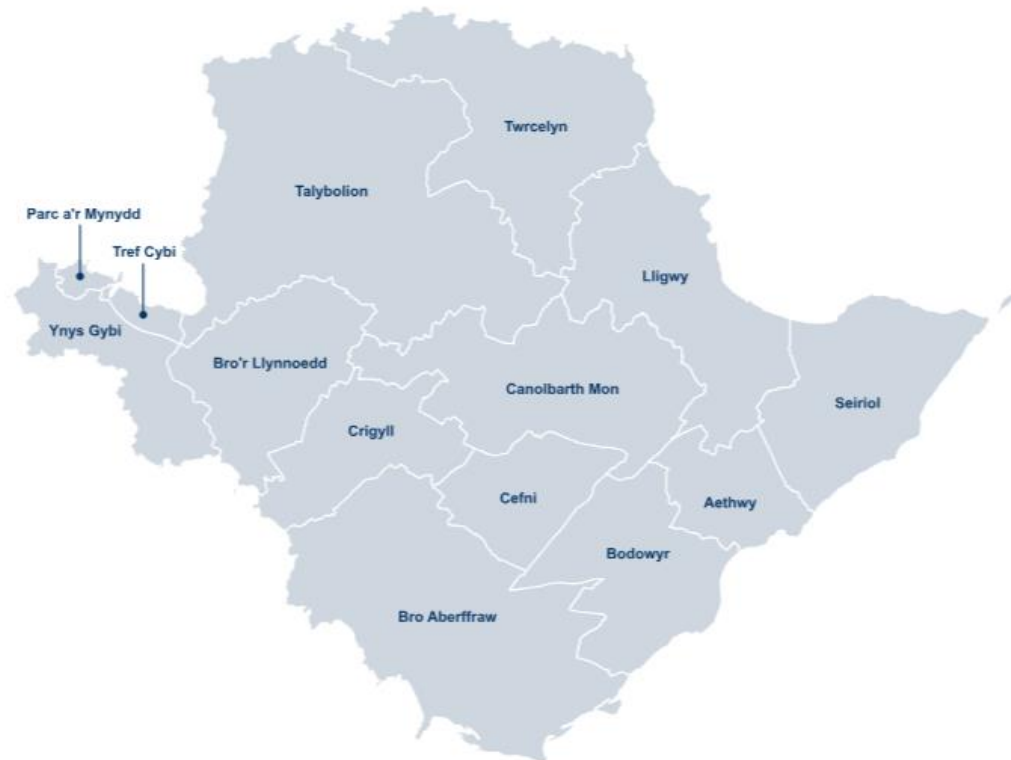
Diagram 2: LDP Area